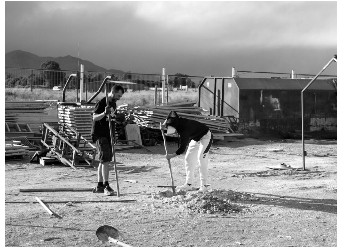
Resident artists from H 2018 working in the territory.