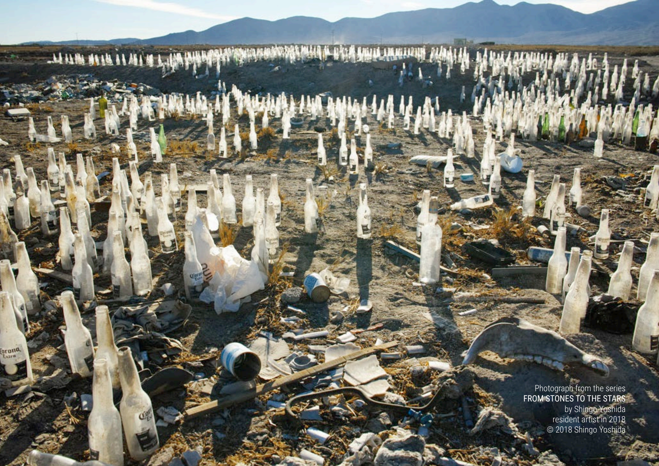
Photograph from the series FROM STONES TO THE STARS by Shingo Yoshida resident artist in 2018