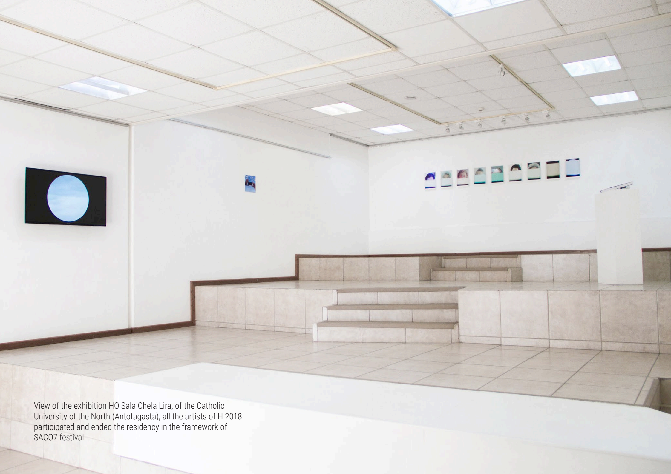
View of the exhibition HO Sala Chela Lira, of the Catholic University of the North (Antofagasta), all the artists of H 2018 participated and ended the residency in the framework of SAC07 festival.