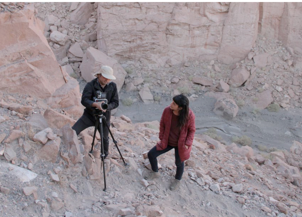
Top image, resident artists with young art students at the Leonardo Da Vinci School in Calama. Bottom image, Resident artists from H 2018 working in the territory.

The residency extends its program from Calama (Chile) to Berlin (Germany), by organizing a talk in a space dedicated to contemporary art in the city, where the artists share their creative process experienced during the residency. In this way, H promotes different aspects of the cultural richness of the Atacama's desert and introduces the cultural and artistic scene of Calama to Berlin.