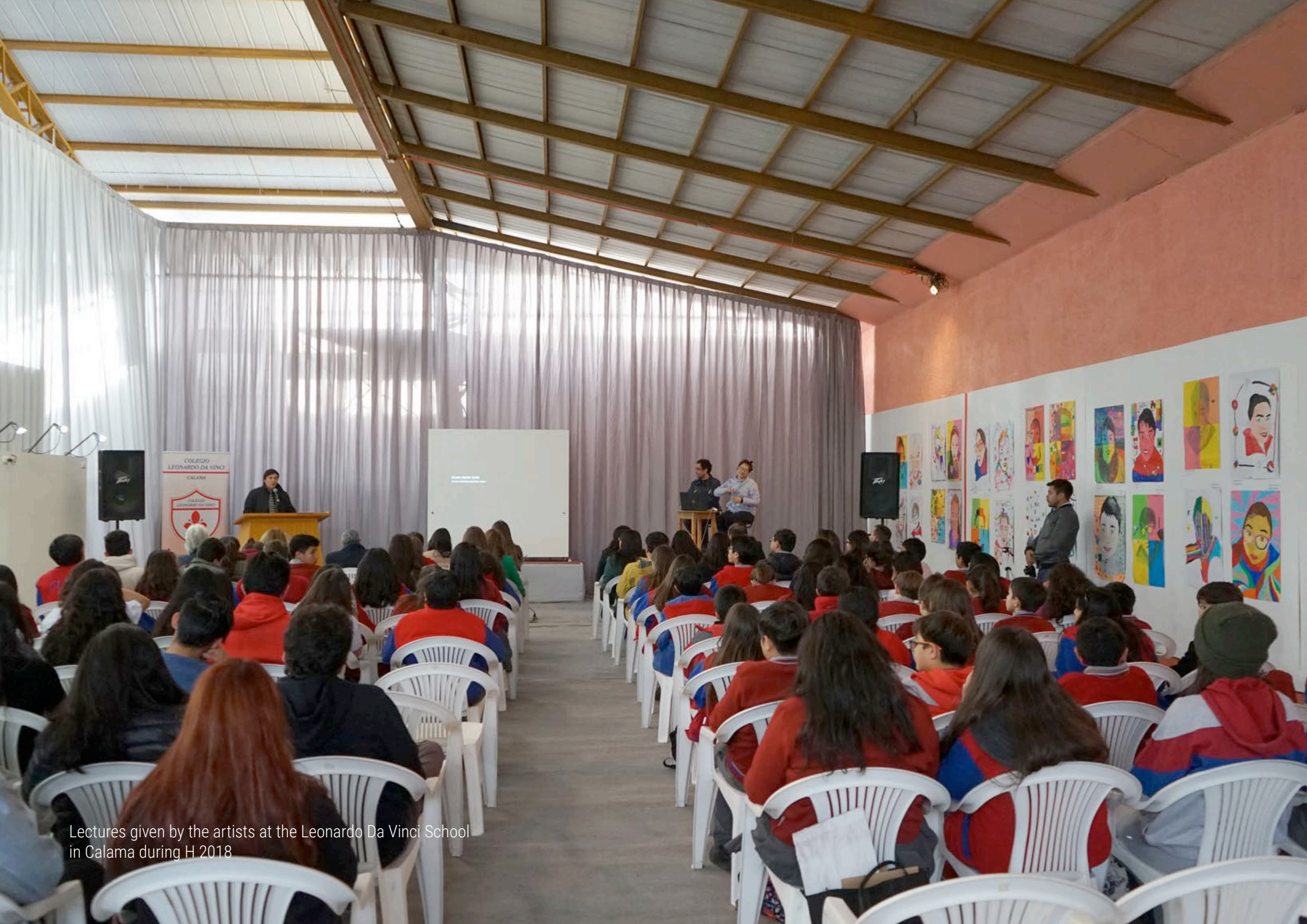
Lectures given by the artists at the Leonardo Da Vinci School in Calama during H 2018